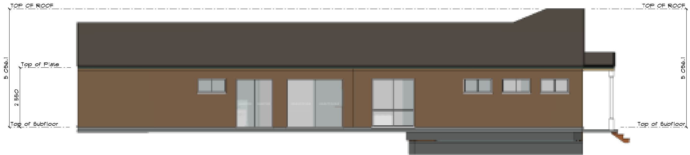
SOUTH ELEVATION SCALE: 1:100